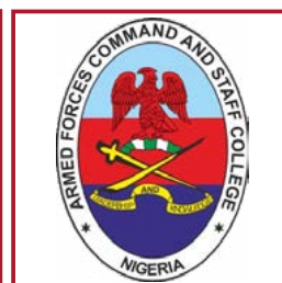
AFCSC, Jaji, Nigeria